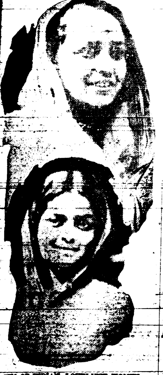
TWO OF INDIA'S LOVELIEST WOMEN

Wife and Daughter of Indian Prince, Maharajah of Baroda