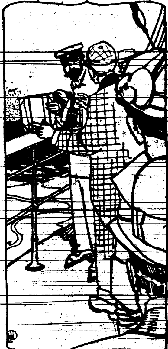
THE CAPTAIN HESITATED.

No one ever found out how the earl's son got the box which besides a clock, contained $100,000 worth of diamonds ashore. He doubtless took Miss Floyd's valuables in the same boat and smuggled them in, as he had promised, but Miss Floyd never saw trace of him again.